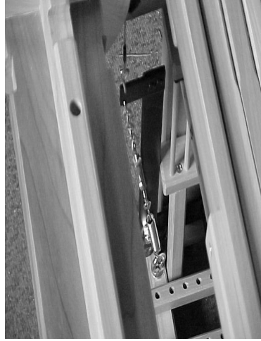
Viewing the brake down toward floor