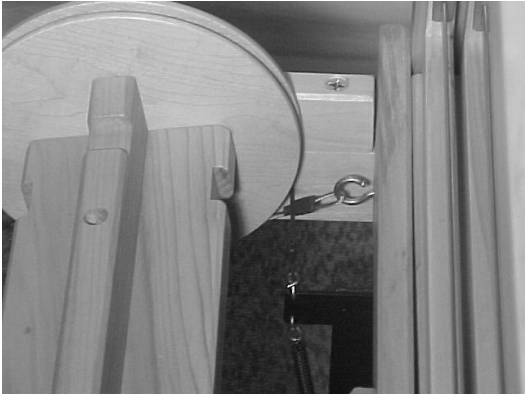
Viewing brake from the inside