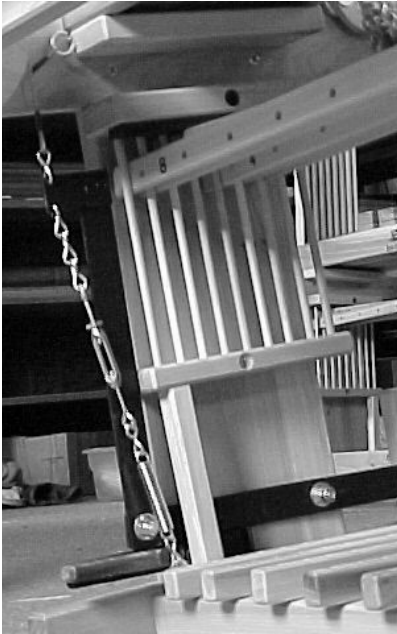
Bottom view of brake